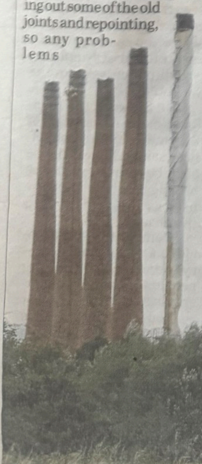
How the chimneys, left, look to passing motorists.