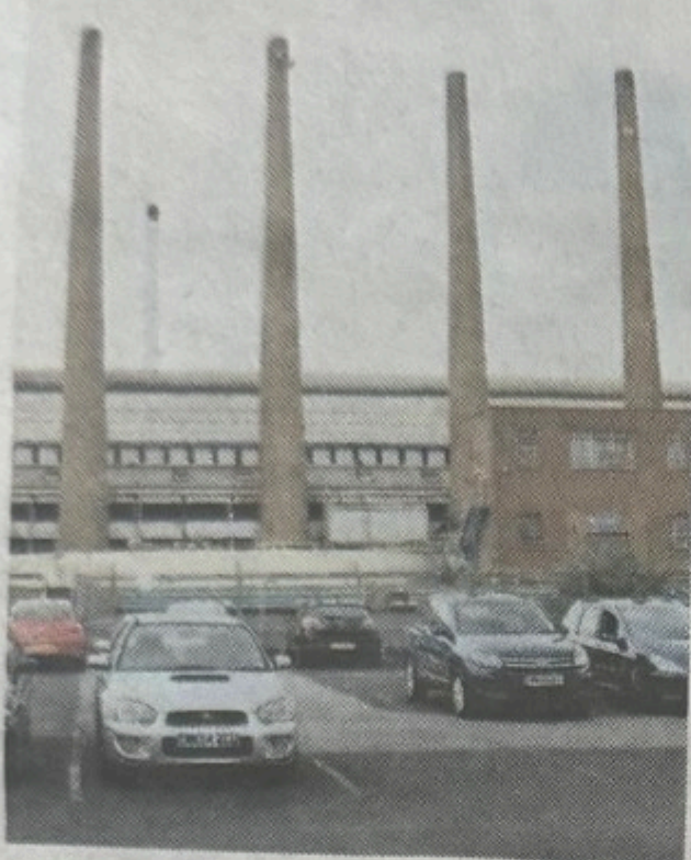
A view of the chimneys from below

"But as part of regular maintenance we identified what work was needed, and now the guys are on site grinding out some of the old joints and repointing, so any problems